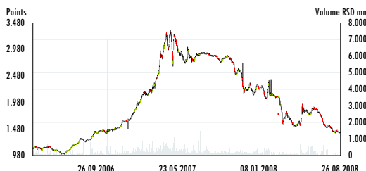
BELEX15 - 3 months performance