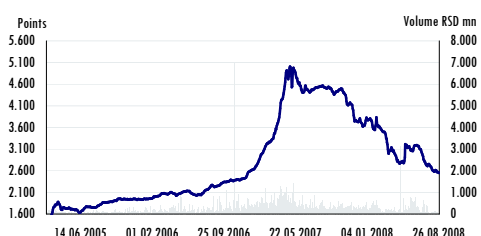
BELEXline - 3 months performance